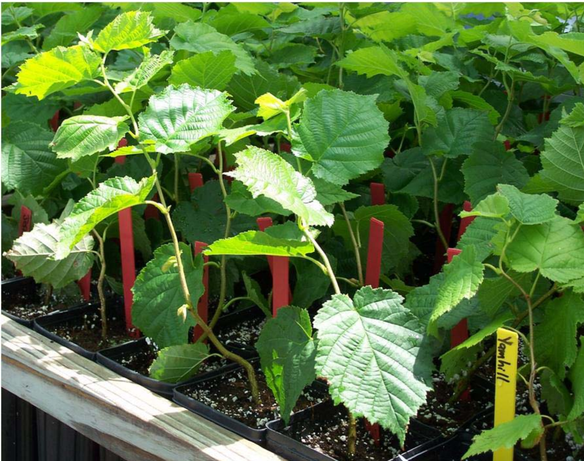
European hazelnuts ‘Yamhill’ and ‘Theta’ in the KSU greenhouses.